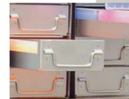
Racks and boxes available (optional)