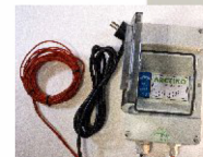
GSM alarm module for optimal safety (optional)