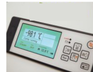
Advanced Arctiko controller

Arctik Mini -86°C range are products of our passion, striving after excellence when we offer the best in ultra low temperature freezing. All features such as alarms and data logging functions are always included as standard. The ULUF -86°C series is produced with the true and original single compressor technology.