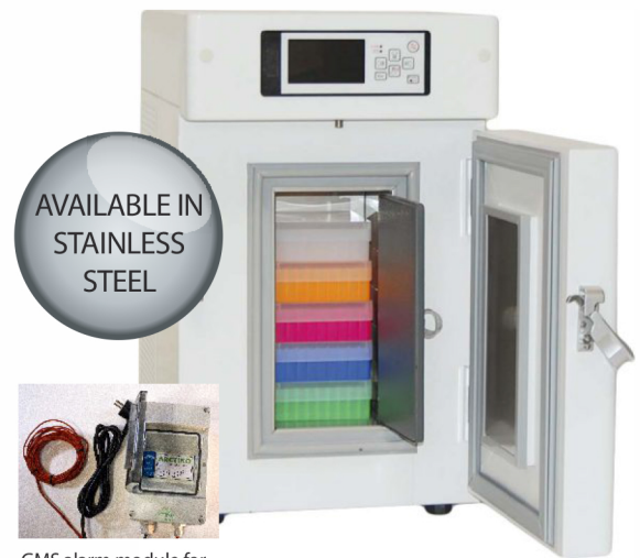
GSM alarm module for optimal safety (optional)

Arctik Mini -86°C range are products of our passion, striving after excellence when we offer the best in ultra low temperature freezing. All features such as alarms and data logging functions are always included as standard. The ULUF -86°C series is produced with the true and original single compressor technology.