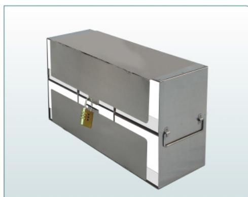
w/DR Lock Device Option