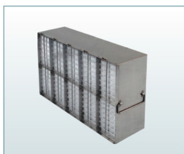
Rack w/ Locking Rod