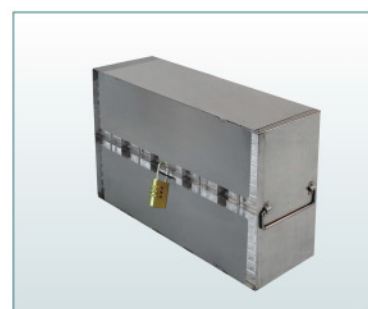
Rack w/DP Lock Device Option